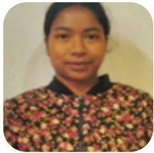
General Duty Assistant Cloud Nine Hospitals Hyderabad