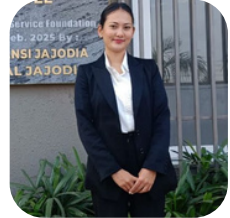
Hospital Front Desk Coordinator Maharaja Agresan Hospital Siliguri