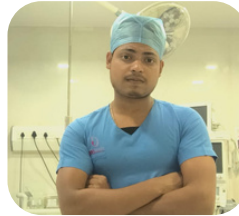
Emergency Medical Technician Cloud Nine Hospitals Mumbai