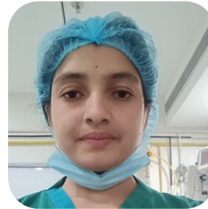
Emergency Medical Technician V One Hospital Indore